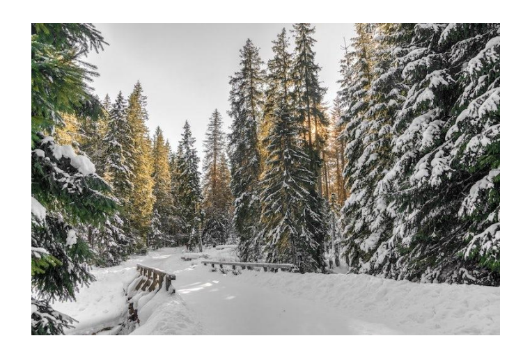
Wishing all of you a Joyful Holiday

Phone: (860) 267-1057 Cell (860) 638-8188 www.cowra-online.org info@cowra-online.org