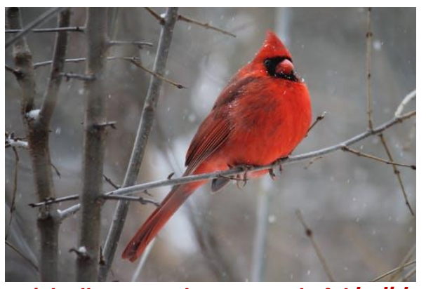
We wish all our members a wonderful holiday