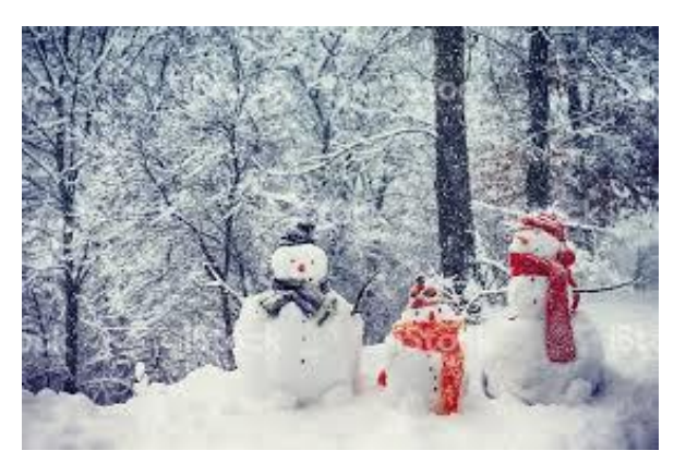
Wishing all of you a Joyful Holiday

Phone: (860) 267-1057 Cell (860) 638-8188 www.cowra-online.org info@cowra-online.org