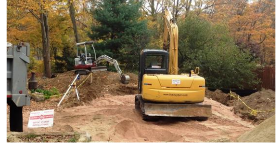
Suburban Sanitation Install