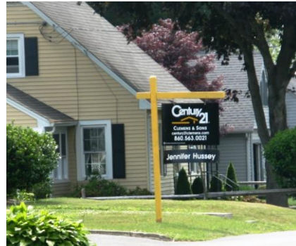
The signs are there.

The Water Pollution Control Authority may approve any such relief plan, subject to the provisions of this Ordinance. An eligible homeowner, as such term is used in this Ordinance, shall mean a homeowner eligible for tax relief for elderly taxpayers under the provisions of sections 12-129b or 12-170aa of the Connecticut General Statutes or eligible for tax relief for elderly or disabled homeowners provided by the Town of Old Saybrook pursuant to section 12-129n(a) of the Connecticut General Statutes. For a complete reading of this relief program your will find this document on the towns website at www.oldsaybrookct.org