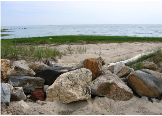
OLD SAYBROOK UPGRADING SEPTIC SYSTEMS