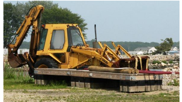
Old Saybrook under construction